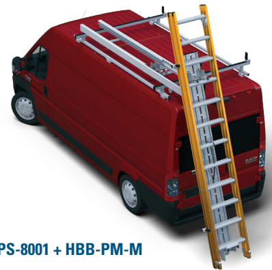
DPS-8001 + HBB-PM-M