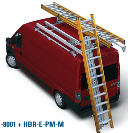
DPS-8001 + HBR-E-PM-M

*Vehicle mounting interface not included; must purchase separately. Standard DeployPro System includes interface and hardware for mounting to the crossbars of a compatible Prime Design ErgoRack. Other mounting solutions are possible; customer supplied hardware may be required.