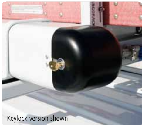
Keylock version shown

Mounts to crossbars. Lightweight and aerodynamic. Available in a keylock or padlock versions.