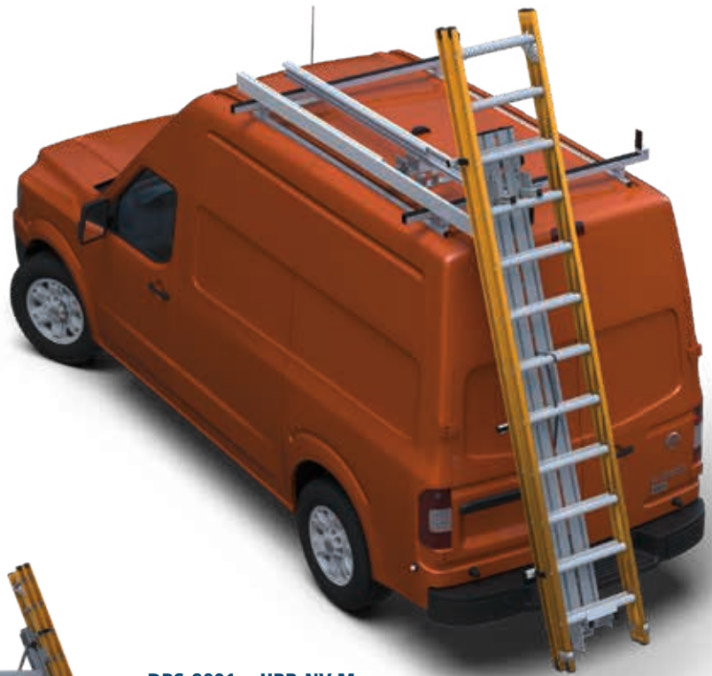
DPS-8001 + HBB-NV-M

The system's deploying and stowing features are ergonomic and help to protect operators from muscle stress, strain and fatigue. Get your fleet or business started today on the road to safety and productivity.