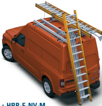
DPS-8001 + HBR-E-NV-M