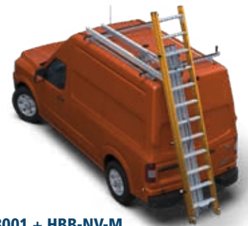
DPS-8001 + HBB-NV-M

*Vehicle mounting interface not included; must purchase separately. Standard DeployPro System includes interface and hardware for mounting to the crossbars of a compatible Prime Design ErgoRack. Other mounting solutions are possible; customer supplied hardware may be required.