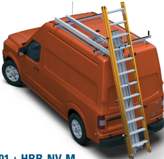
DPS-8001 + HBB-NV-M