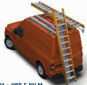
DPS-8001 + HBR-E-NV-M

DeployPro mounts to ErgoRack crossbars on the Base feature side