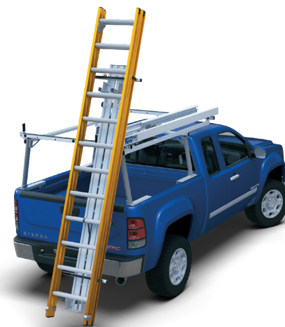
DPS-8000 + PBB-0021

Copyright ©2023 Safe Fleet and its subsidiaries. All rights reserved. No part of this publication may be reproduced by any means without written permission from Safe Fleet. The information in this publication is believed to be accurate. However, Safe Fleet does not make any representation or warranty to that effect and does not assume responsibility for any consequences resulting from use of such information. Revisions or new editions of the publication may be issued (or not issued) in our discretion to incorporate such changes.