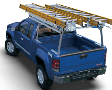
DPS-8000 + PBR-0021