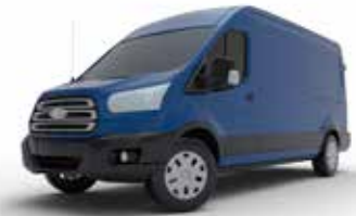
MEDIUM & HIGH ROOF