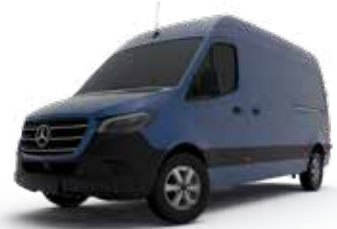
LOW & HIGH ROOF