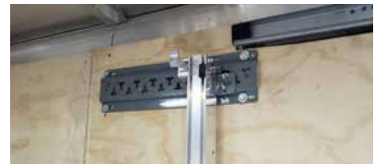
Supports designed for quick installation and eliminate fasteners through the sidewall