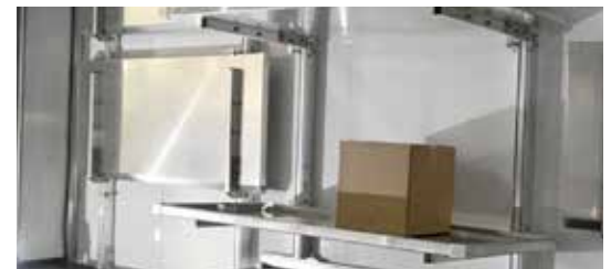
Shelves there when you need them and away when you need space in the cargo area.