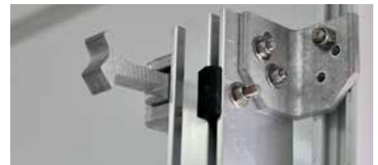
Integrated latch system with rubber grommets for easy deployment and anti-rattle securement of shelf.