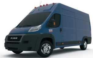
LOW & HIGH ROOF