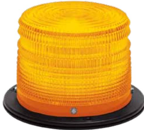
4" model shown