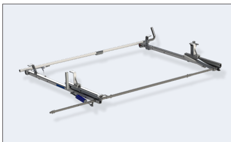
CR-CE-62-M Clamp / Rotation