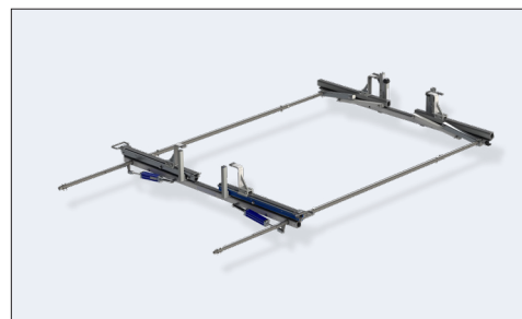
RR-CE-62-M Dual Rotation