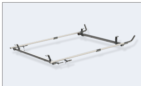
CC-CE-62-M Dual Clamp